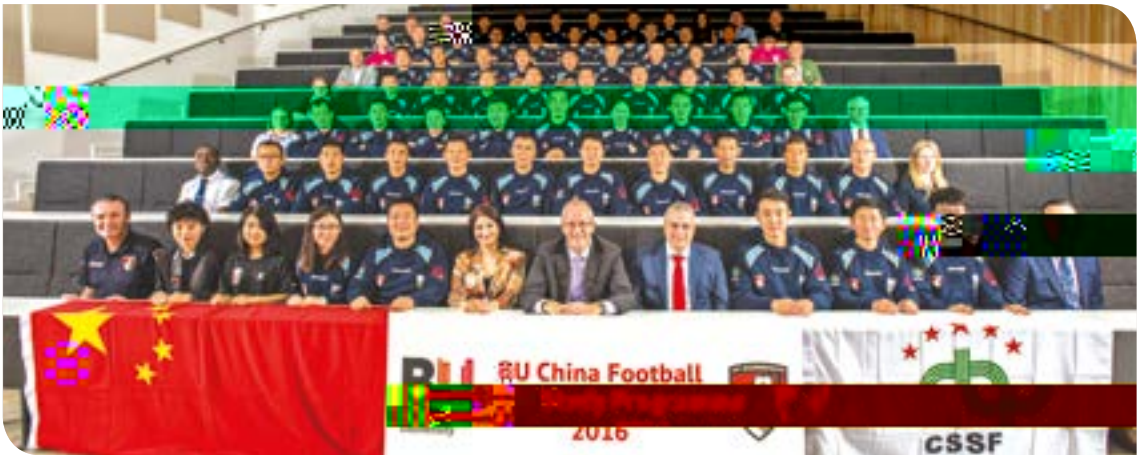
60 coaches from different countries and coaches across China took part in the BU China Football Summer Programme, a new initiative in collaboration with partner AFC Borneo.

For a year after the devastating 2015 earthquake in Nepal, students from BU, along with students from India and Nepal, were stationed in a new base in Kathmandu, reporting on the disaster aftermath. Their aim was to change radiological journalism by capturing the voice of Nepalese people at the disaster site, record and life after the earthquake.