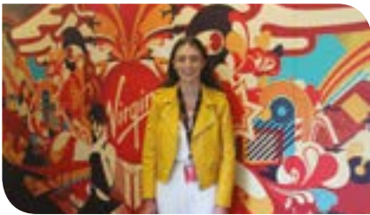
Ahead of the 2016 Festival of Design & Technology, the Vice-Chancellor visited graduates now working at bespoke exhibition